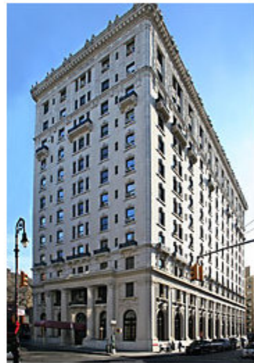
Watchtower Bible and Tract Society

The ornate lobby of the former Hotel Bossert in Brooklyn Heights, which was returned to its glory by its current owners, the Jehovah's Witnesses.